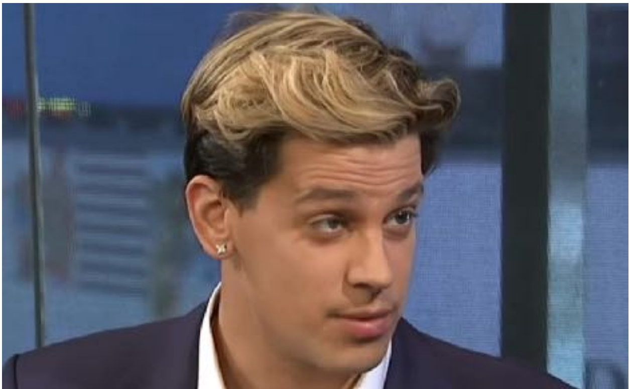
Milo Yiannopoulos