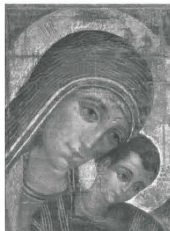
Immaculate Conception Parish

However, she holds that consideration in depth of all the aspects of these problems offers a new and stronger confirmation of the importance of the authentic teaching on birth regulation repropounded in the Second Vatican Council and in the Encyclical Humanae vitae .